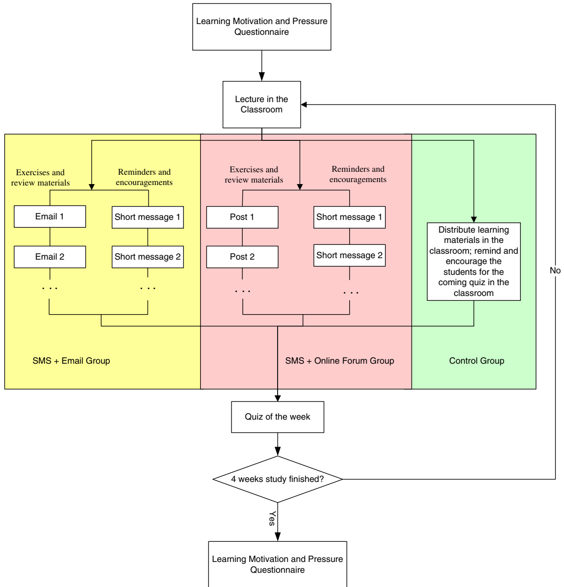
Fig. 2. Procedure of experiment 2.

and encourage them to hold on. Students in the control group were given the exact same information, but did not have any other communication with the instructor except for face-to-face interaction in the classroom. In each week the amount of messages/posts/emails varied depending on the lecture content of that week. In the first week, seven posts were posted for the SMS + forum group; students in SMS + email group received seven emails with the same content. Nearly the same four messages were sent to students in these two groups. In the second week, two posts/emails and three short messages; in the third week, two posts/emails and two short messages; and in the fourth week, two posts and three messages were distributed to students in the two experimental groups. The order and the content of these posts/emails/messages were detailed in Appendix B . Students took two quizzes once a week to examine their learning performance. All participants were required to complete a questionnaire for measuring learning motivation and perceived pressure before and after the experiment.