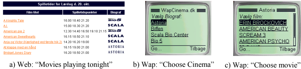
Fig. 4. An existing cinema information system for web (a) and wap (b and c)

playing times. While the website is straightforward to use, the wap-site requires a lot of clicking due to the division of information into a large number of sub-pages.