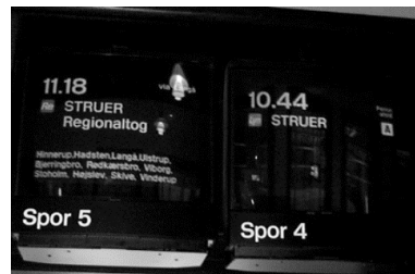
Fig. 3. Electronic timetable: spatial and temporal indexicality